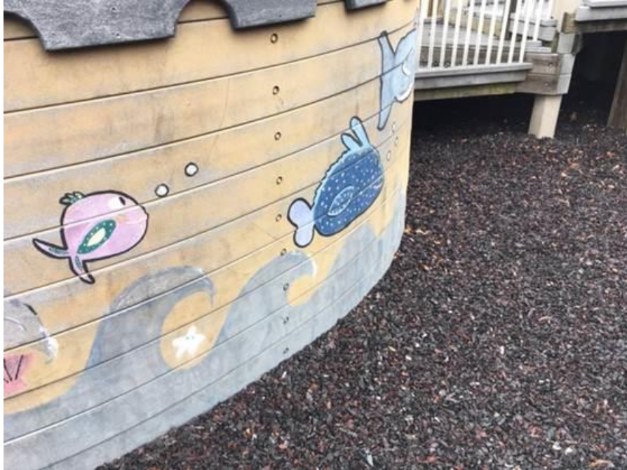
Photo caption: Faded artwork at Annie's Playground in Fallston to be restored by art students at The John Carroll School.